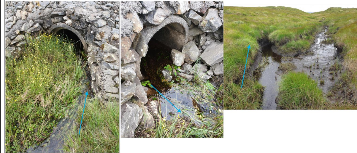
Baseline sampling location SW5. Photo taken during site survey carried out 25/07/19.