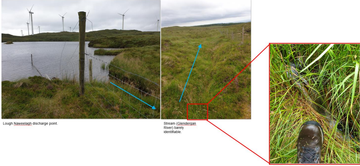
Lough Naweelagh discharge point.