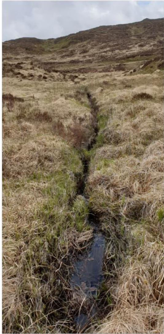
Natural Drainage Channels