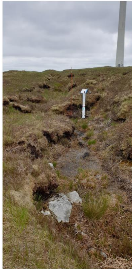
Natural Drainage Channels