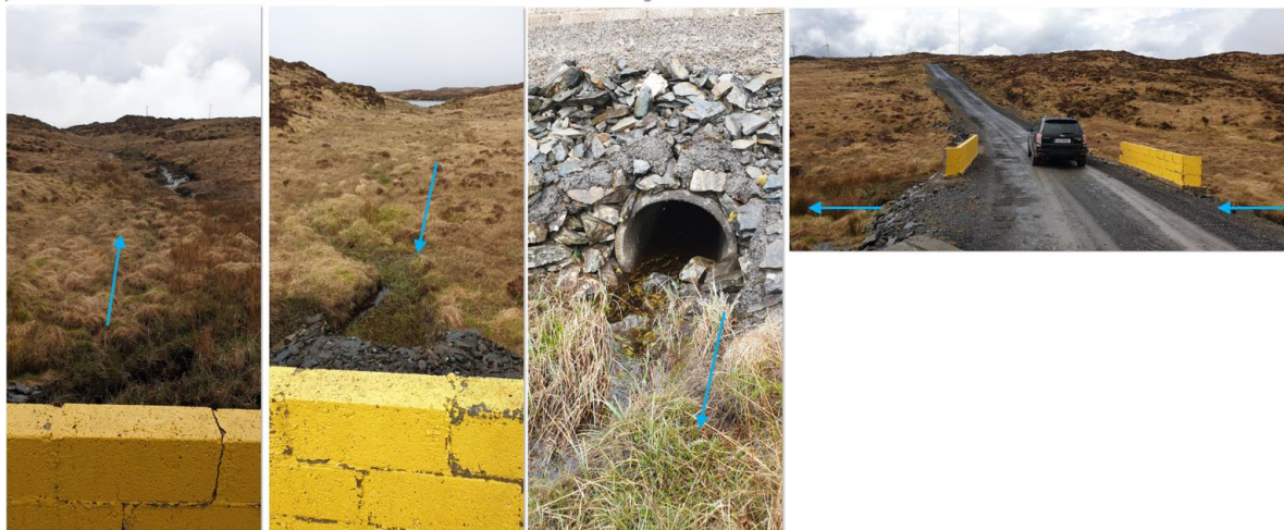
Example of natural drainage channel which has been modified by the introduction of this watercourse crossing (associated with the existing Barnesmore Windfarm). Lough Nabrackboy discharges into Lough Golagh via this surface water channel. Baseline sampling location SW5. Photo taken during site survey carried out 09/04/19.