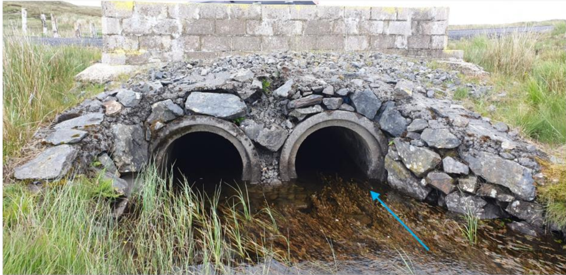
Example of natural drainage channel which has been modified by the introduction of this watercourse crossing (associated with the existing Barnesmore Windfarm). Lough Golagh discharges into receiving surface water system at this location i.e. baseline sampling location SW1. Photo taken during site survey carried out 09/04/19.