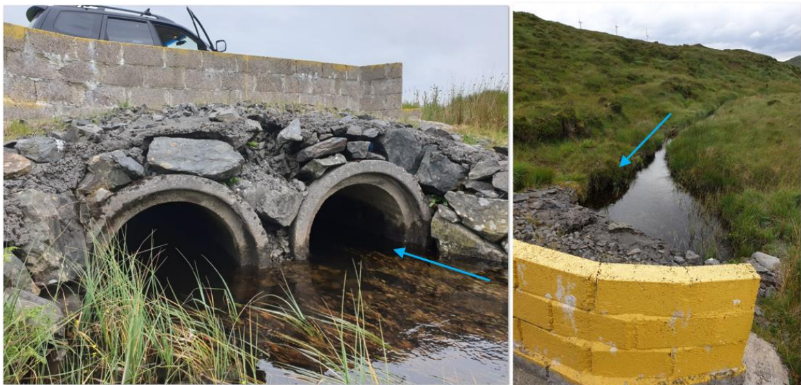
Baseline sampling location SW1. Photo taken during site survey carried out 25/07/19.