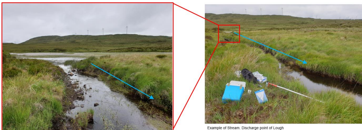
Example of Stream. Discharge point of Lough Naleaghany.