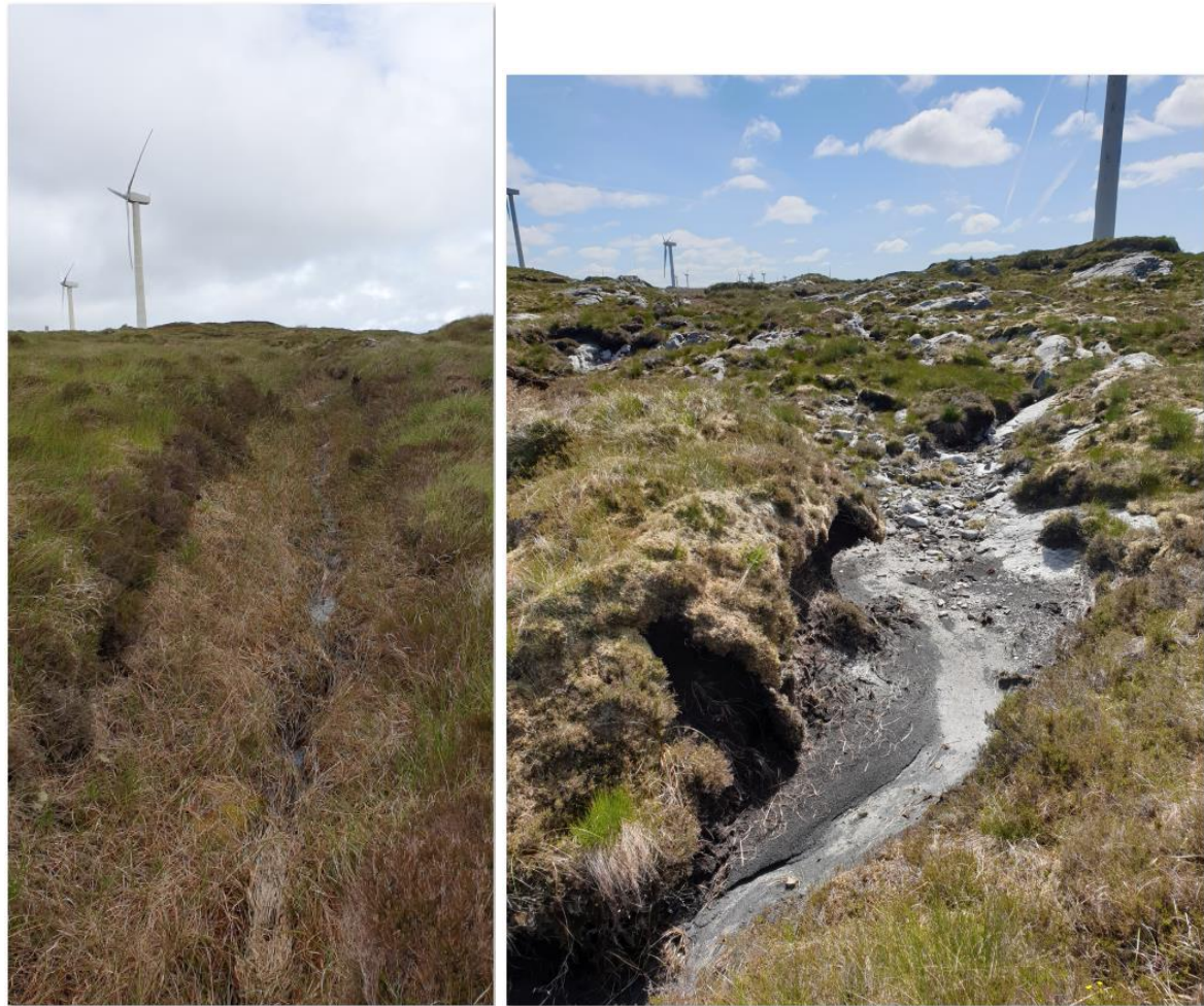
Natural Drainage Channels & Evidence of Erosion