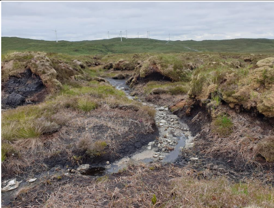
Natural Drainage Channels & Evidence of Erosion