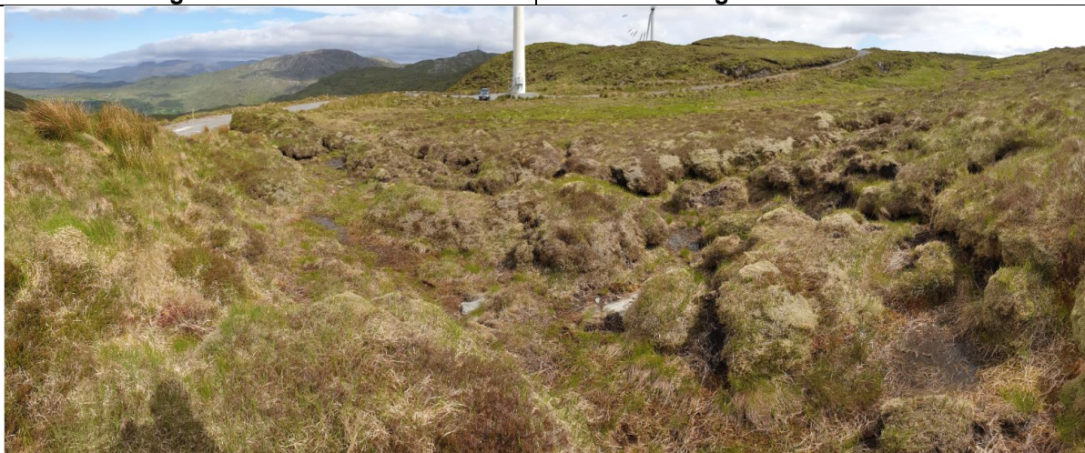
Natural Drainage Channels